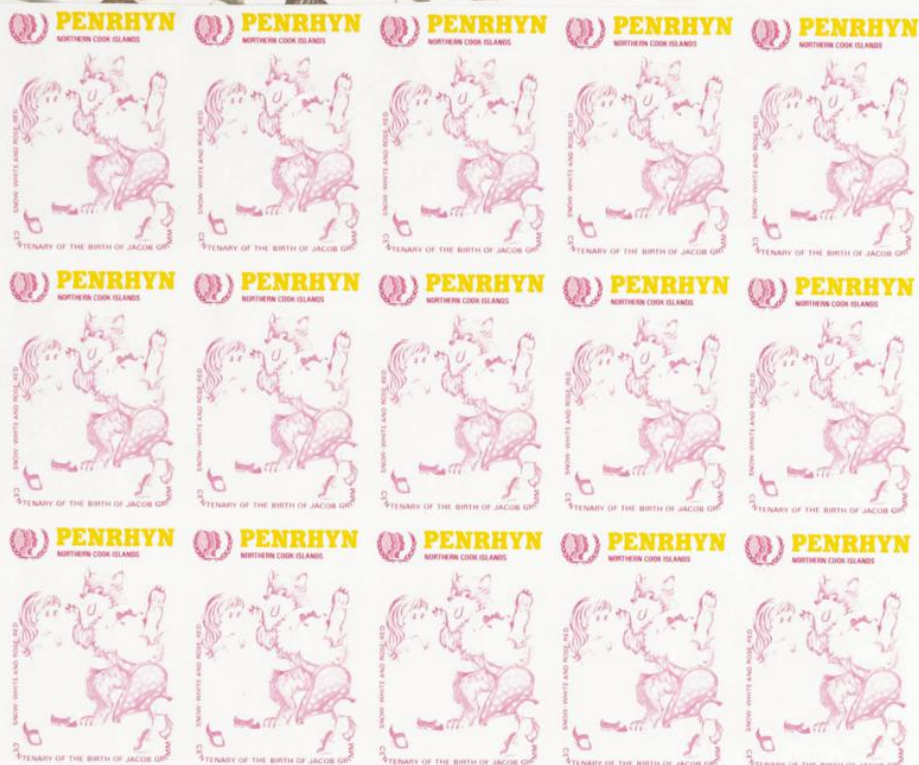
NORTHERN COOK ISLANDS