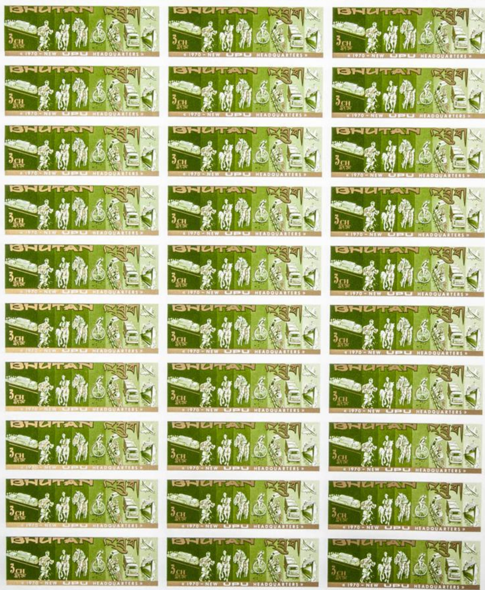
« 1970 - NEW UPU HEADQUARTERS »