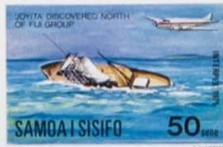
«Joyita» was found deserted, north of the Fiji group