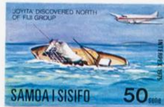
«Joyita» was found deserted, north of the Fiji group