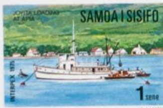
«Joyita» loading in Apia Harbour during September 1955