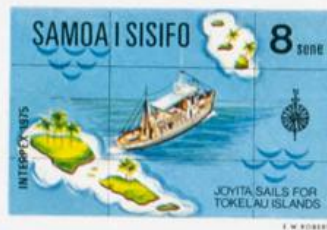
«Joyita» leaves Apia for a voyage to the Tokelau Islands