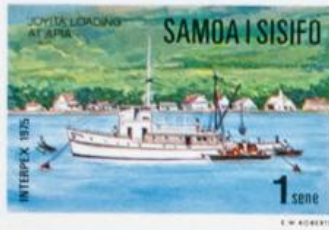
«Joyita» loading in Apia Harbour during September 1955