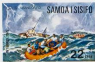
Crew and passengers take to the rafts and abandon «Joyita»