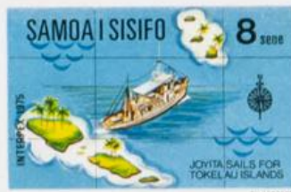
«Joyita» leaves Apia for a voyage to the Tokelau Islands