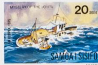
The Mystery of the «Joyita» - preparing to abandon the ship