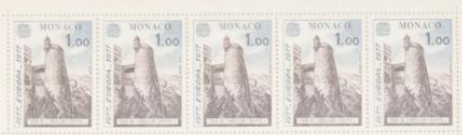
MONACO TOUR DE L'OREILLON (XVIII e S.)