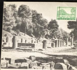
DENOMINATION DRACHMAE 150 - OLYMPIA

Olympia was one of the brightest jewels of the miracle that was Ancient Greece. Situated in the Peloponnese, in the sea-garmented valley thickly wooded with pine and intersected by the rivers Alpheus and Cladeus, Olympia was not a town but a great sanctuary where Olympian Zeus and the golden Hera were worshipped. A number of large statues of Zeus under the ruins of Hera's temple, bear witness to its former grandeur.