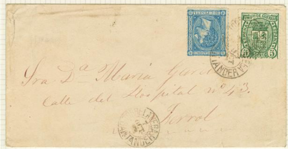
1875, Oct. 7, Torrelavega to Ferrol.