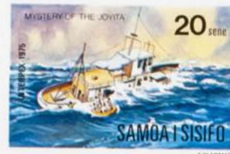
The Mystery of the «Joyita» - preparing to abandon the ship