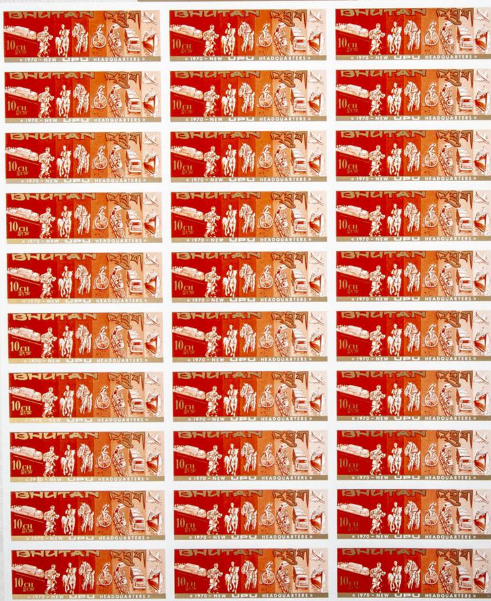
« 1970 - NEW UPU HEADQUARTERS »