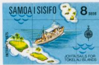
«Joyita» leaves Apia for a voyage to the Tokelau Islands